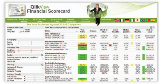
Example: Financial Scorecard App

With regard to the ROI, I dare say that QlikView is of major value to Aon. Quantifying our cost savings or QlikView's ROI doesn't do the solution enough justice. After all, how can one measure the true value of true Business Discovery, which helps the entire organization focus on KPIs, revenue growth and cost reduction?