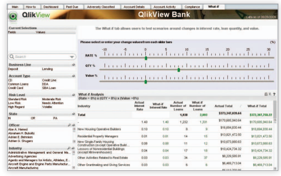
Example: Credit Risk App