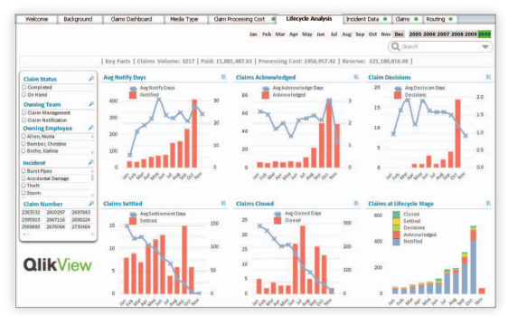
Example: Insurance Claims Handling App

For nine quarters we have achieved an above average closing ratio. Dormant files have been eliminated and our portfolio has been optimized. QlikView has been a great asset in achieving this. The biggest change however, lies in the business approach: from reactive to steering.