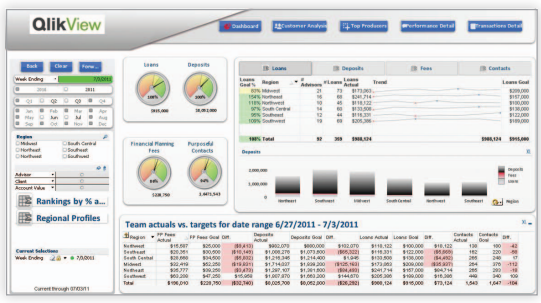
Example: Wealth Management App

In order to compete in a very competitive market, we needed a solution that harnessed all of our data, presented it in a timely manner, and provided greater insight and operational effectiveness for our company.