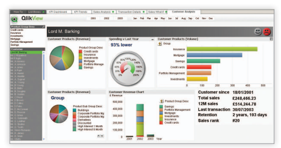
Example: Retail Banking Customer Analysis App

Thanks to QlikView, customer data is now available to us more quickly, more clearly, and more comprehensibly than before. This transparency is a significant prerequisite for the efficient organization of our customer relations.