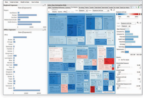
Example: Real-Time/Intraday Liquidity Risk App. Developed with Panopticon, OlikView Technology Partner