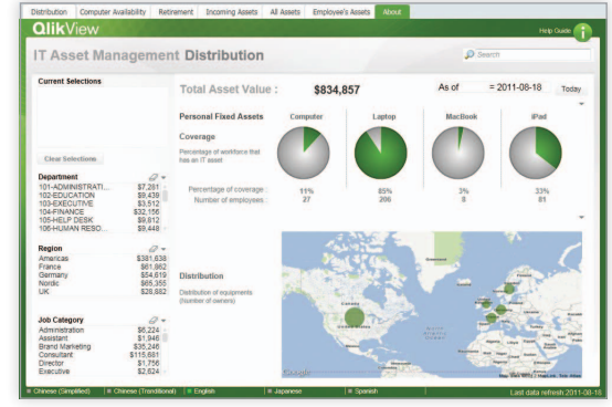
Example: IT Asset Management App

The AxisGroup Compass PPM (QlikView) solution gave us visibility to data that allowed us to achieve a $10M spend reduction for the quarter, and we still delivered everything we committed to!