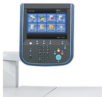
Integrated Copy/Print Server