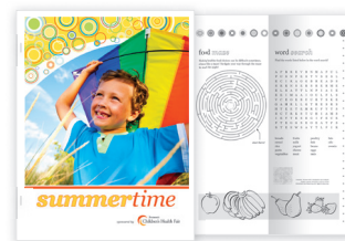
Color Inserts, Staple and Engineering Z-Fold