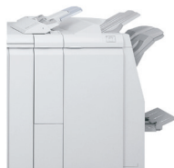
Booklet Maker Finisher with Optional C/Z Folding