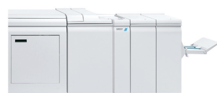
Plockmatic Pro30™ Booklet Maker*