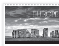
Die Set Punch