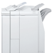
Standard Finisher with Optional C/Z Folding