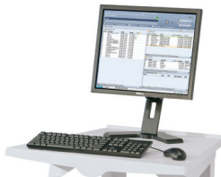
Xerox® FreeFlow Print Server