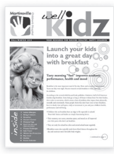
Squarefold Trim Booklet