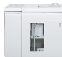
Interface Module and High-Capacity Stacker*