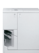
Xerox® Tape Binder*