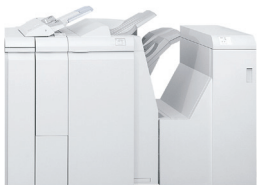
Standard Finisher Plus