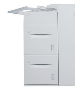
2-Tray High-Capacity Feeder 2,000 sheets each tray (4,000 sheets total): Letter-size