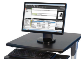
Xerox® EX Print Server, powered by Fiery