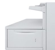
Oversized High-Capacity Feeder 2,000 sheets: Up to 13 x 19.2 in.