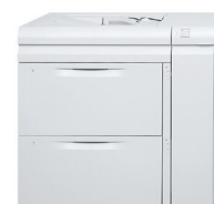
2-Tray Oversized High-Capacity Feeder* 2,000 sheets each tray (4,000 sheets total): Up to 13 x 19.2 in.