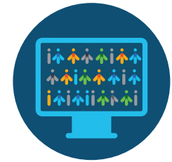
Consistent management across all sites