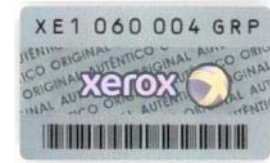
New Authentication Label

Xerox is introducing a mobile application that will allow you to image the supplies carton authentication label and submit for verification & points. Simply scan the barcode and Xerox will do the rest.